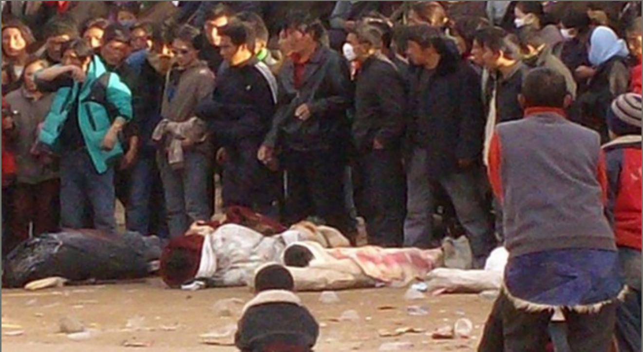
Aftermath of a 2008 protest in Tibet.

So when do you draw the line? Before it's too late.