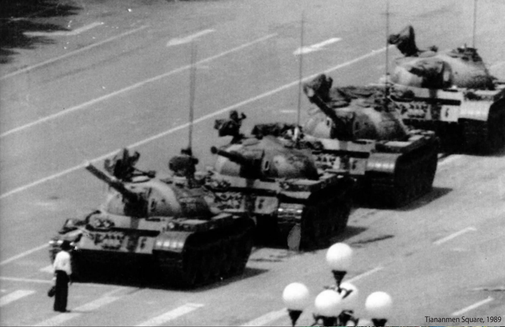
Tiananmen Square, 1989