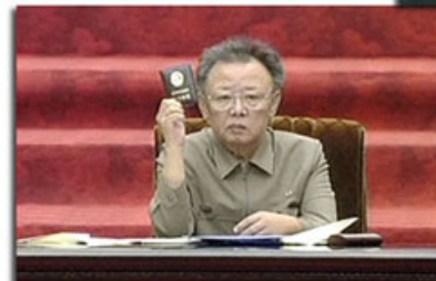
Kim Jong il