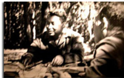
Pol Pot, Khmer Rouge

The Canada Tibet Committee supports a cohesive, multifaceted approach to Canada's relations with China, where government, business, and even ordinary Canadians have a role to play. We envision a relationship where we won't need to jettison our values as we pursue new economic opportunities, because both countries will appreciate that sustainable relations are built on mutual trust and respect.