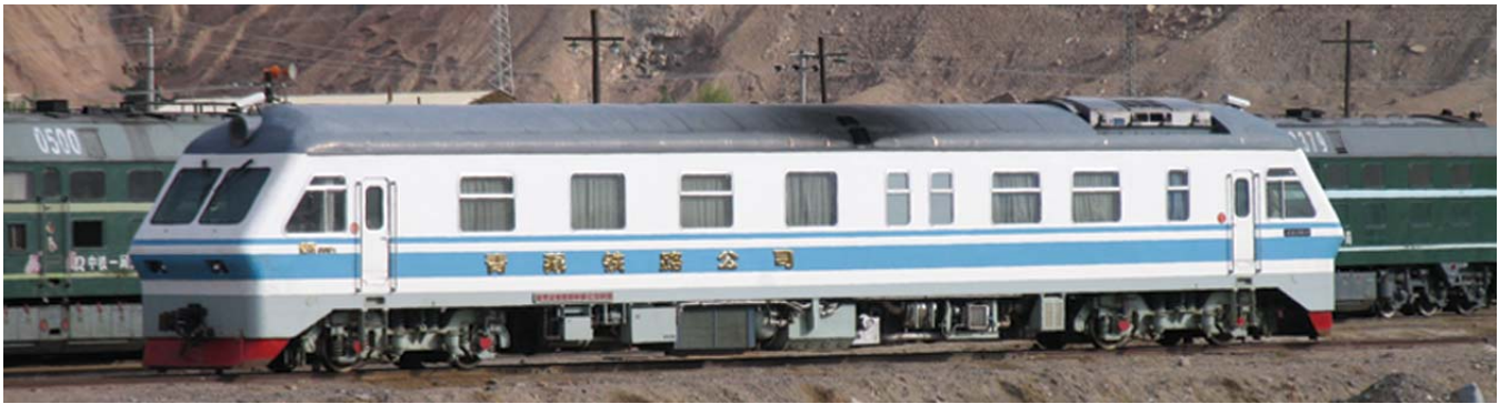
Railcar used on the Qinghai-Tibet Railway.

Another 'success' of the Western Development Strategy often touted by Beijing is a natural gas pipeline which runs from Xinjiang in the far west of the PRC 4000 km (2485 miles) all the way to Shanghai on the east coast. Natural gas is reportedly not taken from the pipeline until it crosses Shaanxi Province, more than 1000 miles from the source of the gas and the people in Xinjiang who are supposed to have benefited from it.