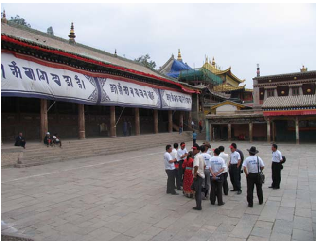
Tour group visiting Kumbum. With the resurgence of religion in China, Tibet has seen a dramatic increase in Chinese tourists visiting monasteries and holy places .