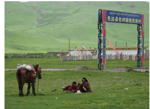
Nomads outside a new settlement area in the Tibetan area of Kham, now in Sichuan province.

In some areas of Tibet, you may see new housing complexes by roadsides, or near to mining sites or other development projects. While the housing often looks modern and pleasant, it is worth bearing in mind that these might be the new homes of herders or villagers who have been settled here and removed from the traditional rural homes or tents on the nomad pastures, from livelihoods that have sustained them for centuries. Sometimes, while the homes look brand new, they may not have electricity, and there may be no amenities nearby. What you are witnessing is part of China's long-term strategy of control (it is easier to manage a population with fixed addresses) and to absorb Tibet into the People's Republic of China – urbanization (both in the creation of new towns and expansion of existing ones) and the resettlement of nomadic herders. While the stated official intention is to prevent degradation of the grasslands and to lift nomads out of poverty, the reality is that this is, in most cases, achieving the opposite.