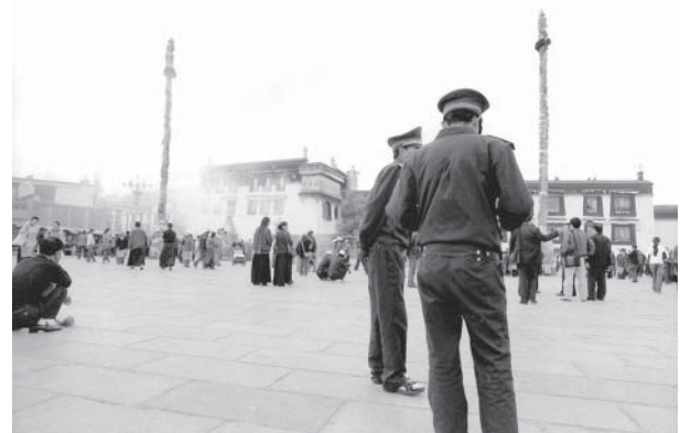
Police outside the Jokhang Temple. The strong police and military presence in Lhasa serves as a strong reminder of China's administrative control in the region.

If you insist on being assigned a Tibetan tour guide, be aware of the additional political pressure they are under; be aware that what for you might be a friendly conversation might for them be straying into difficult areas where they are extremely prone to saying something "wrong" within earshot of someone willing to report them; and be aware too that by hiring – and tipping! – a Tibetan tour guide, your money is more likely to better serve Tibetan interests in Tibet. If you are travelling with a tour operator from outside of China, tell them you want a Tibetan guide - and you could also give your tour operator a copy of this report