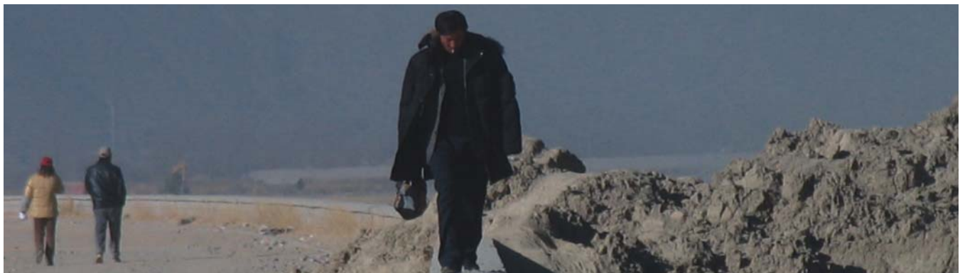
A Tibetan early in the laying of tracks for the world’s highest altitude railway, running to Tibet from China. Most workers on the railroad were Chinese, with Tibetans doing largely unskilled manual labor.