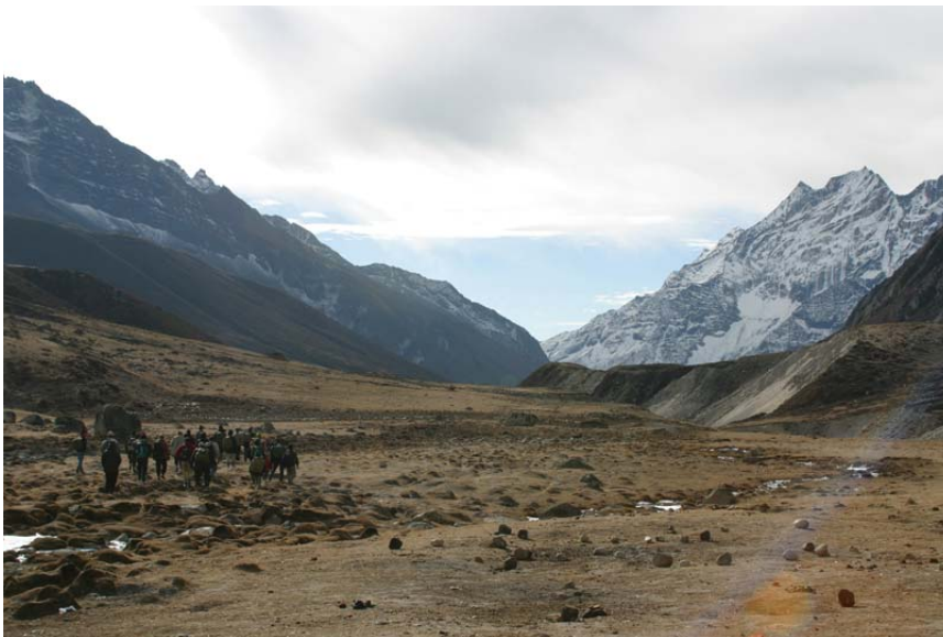
Group of Tibetans on the dangerous journey into exile across the Nangpa Pass into Nepal.