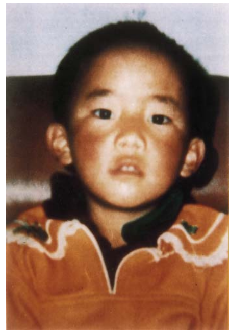
The 11th Panchen Lama, Gedun Choekyi Nyima.

In monasteries and nunneries in Tibet, generally the more revered a person is, the higher their portrait is hung compared to other portraits on the shrine, although there are other considerations of symmetry and balance when giving a portrait prominence. If you see a portrait of the Dalai Lama on a shrine in Tibet, do not bring any attention to it. Instead, be aware that you are witnessing a subtle form of Tibetan dissent against Chinese religious policies, and a courageous expression of undiminished loyalty despite political pressure.