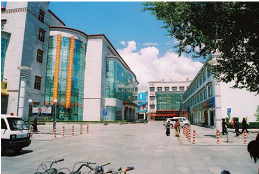
Lhasa is fast becoming a modern Chinese city, at the expense of local Tibetans.

In Lhasa, travelers prepared to observe more closely will see the beggars on the streets, the pervasive presence of the Chinese military, and note too that most of the traders are actually Chinese rather than Tibetan. A harmless looking radio transmitter is actually there to jam Tibetan language broadcasts from foreign radio stations such as Voice of America, Voice of Tibet and Radio Free Asia. The ornate curlicues on the façade of a building may be in the Tibetan style, but they cannot hide the absence of genuine Tibetan architecture – less than three per cent of the 'Tibetan quarter' of Lhasa remains following the demolition and transformation of Lhasa into a Chinese city.