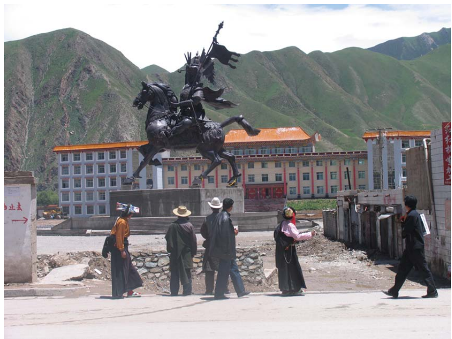
Statue of King Gesar, a legendary warrior famous throughout Central Asia, remains a cultural icon in modern Tibet. This statue is in the Tibetan area of Jyekundo, capital of Yushu Prefecture.

This guide will urge you not to be taken in by one of the largest and best-funded propaganda machines the world has ever seen, the Chinese Communist Party. It will attempt to supply you with the tools to make up your own mind about what you see when you go to Tibet, and how to ensure that your presence in Tibet is not detrimental to the Tibetan people, and that the Tibetan people may even derive some direct benefit.