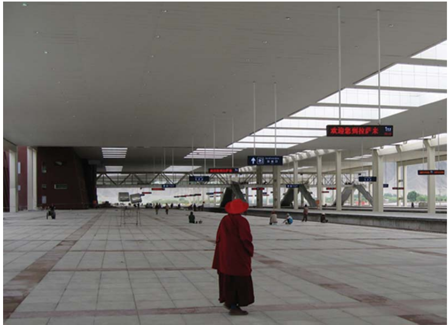
A woman stands on the platform of the new Lhasa railway station. The arrival of the railway to Lhasa has changed the face of tourism in Tibet. Each platform is more than eight meters wide - approximately the width of three trucks parking next to each other.

You should also be able to see this in the other “pillar industry” of Tibetan handicrafts on sale in Lhasa and elsewhere in Tibet: most of it is being sold by Chinese traders who according to some reports seen by ICT, obtain their stock from factories in mainland China. Another “pillar industry” in Tibet, collecting plants used in Tibetan medicine, can be lucrative. But increasingly, Chinese companies