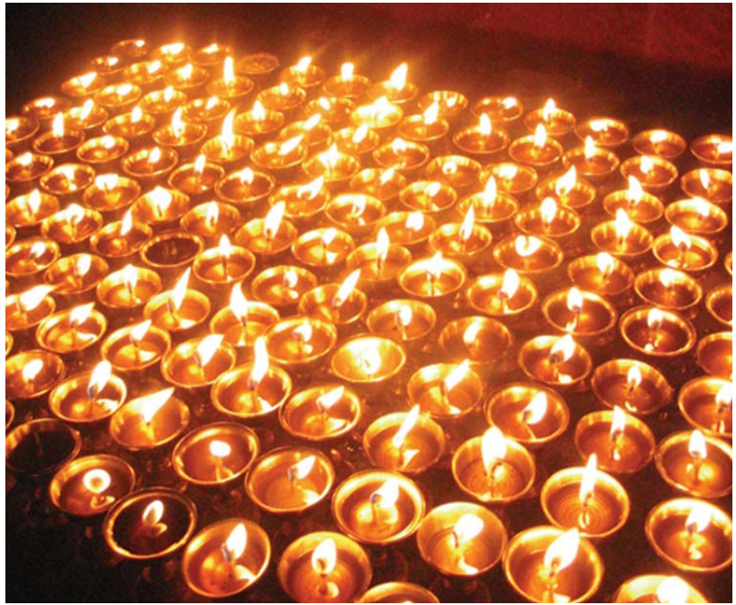
Butter-lamps at the Jokhang Temple in Lhasa.

The Chinese Communists are deeply mistrustful of religion, seeing the Dalai Lama's leadership as another pole of authority that threatens their exercise of power in Tibet. Soon after the revolution in China in 1949 they moved to 'liberate' Tibet from what they regarded as the repressive and exploitative oppressors in Tibetan society: the monastic system and the aristocracy. There is little doubt that actually, Tibet was indeed a desperately poor and deeply unequal society, but reform was underway, pioneered by the 13th Dalai Lama and others. There were also Tibetans who initially saw promise and hope for a more egalitarian and humane society in China's plans for Tibet, but even the most ardent Tibetan communists were soon disillusioned and despairing of Tibet's fate under Chinese rule.