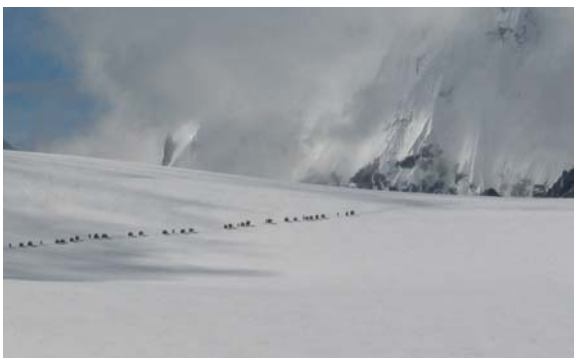
Tibetan herders move yaks across the Nangpa Pass, a route well traveled by Tibetan refugees heading across the Himalayas to Nepal.

Under no circumstances should you attempt to engage anyone at a monastic institution in a conversation about religious freedom, the Dalai Lama, or Tibet's political status. If you do, you could put that person in an extremely awkward and dangerous position. Some of the monks and nuns spoken to by ICT claim to be adept at deflecting political questions asked by their institution's management committee, by feigning ignorance or giving simple and evasive answers.