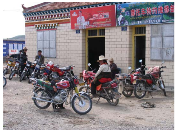
Nomads on motor-bikes in Amdo, eastern Tibet, now Qinghai. Under Chinese policies of urbanization, more and more Tibetan nomads are required to settle in towns.