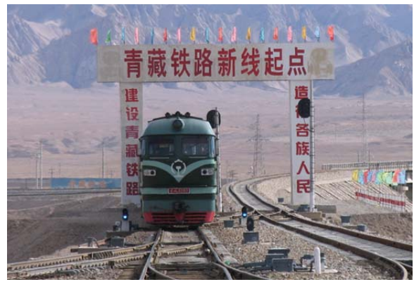
Qinghai-Tibet Railway. The sign reads: “The new starting point of the Qinghai-Tibet Railroad. Build the Qinghai-Tibet Railroad to create happiness for the people of all nationalities”