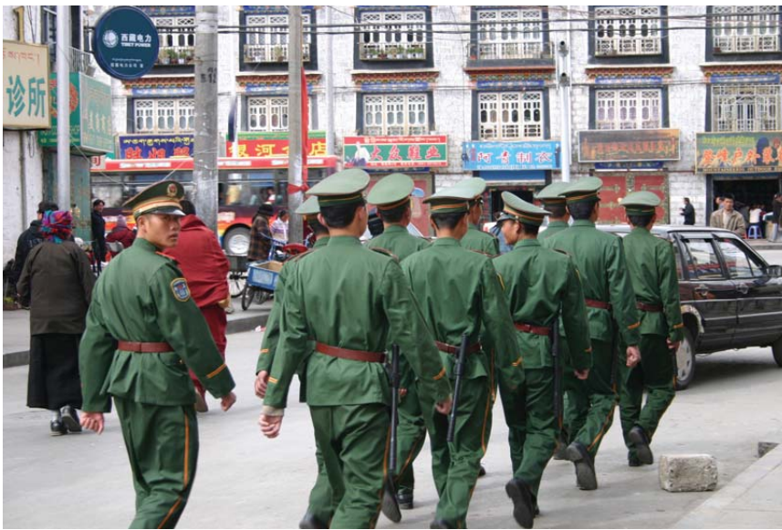
Chinese soldiers in Lhasa, 2006.