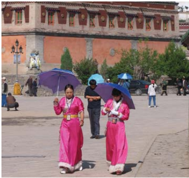
Chinese in Tibetan dress at a monastery in eastern Tibet demonstrate the attraction of Tibet exotic to Chinese people.

Tourism is indeed proving to be a ‘pillar industry’ as planned by the Chinese authorities. In 2006, tourism accounted for 9.5% of the TAR’s GDP, an important source of independent revenue for the TAR for whom 90% of its annual expenditure comes from central government subsidies.