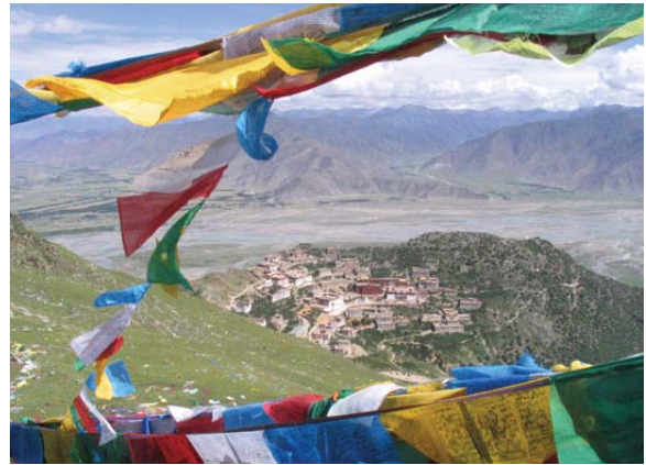
Tibetan prayer flags near Ganden Monastery.

The few intrepid travelers who made it to Tibet in the 1980s were generally aware of the situation there before they set out on their journey – at least, as aware as they could be in light of the authorities’ attempts to block information flow on Tibet. It is notable that there are very few accounts of travel to Tibet by non-Chinese writers in the last 50 years and more which do not dwell on the Chinese state’s oppression of the Tibetan people and the destruction of Tibetan culture.