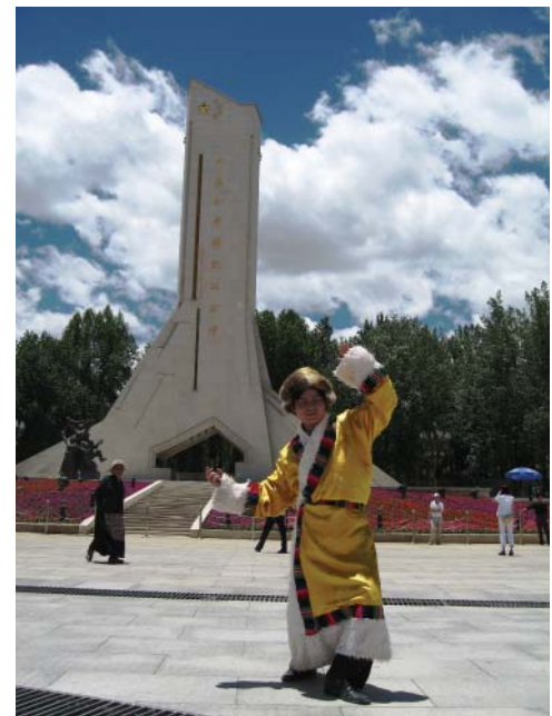
A Chinese performer wearing an imitation of the traditional Tibetan chuba poses in front of the Peaceful Liberation Monument for tourists.

Monastic institutions in Tibet – monasteries, nunneries and temples – can no longer rely on their local communities for support. The Chinese authorities have ordered that religious institutions have to "lessen the burden" on the communities who used to contribute voluntarily or through a system of taxation to the institutions' upkeep in return for spiritual guidance. Tourism has been identified as a main stream of revenue for monastic institutions, and as a tourist to Tibet you are likely to be keen to want to visit one or more monasteries while you're there.