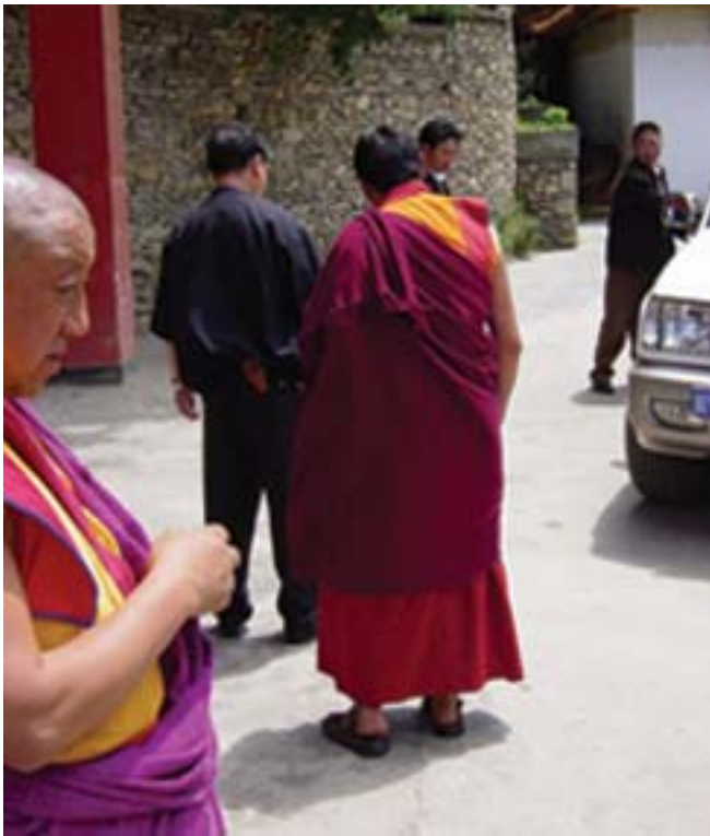
The presence of security personel at monasteries and nunneries is particularly visible during political and patriotic education campaigns as in this photo taken at a monastery in Sichuan province (a gun holder is visible on the belt of one of the security officials).

The same writer goes on to describe what effect tourism has on the religious life of the monastery: