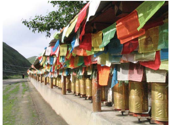
Tibetan prayer wheels and flags, believed to carry blessings in the wind.

In the May Day holiday in 2007 – a national one week vacation – 340,000 tourists went to Tibet between May 1 and 7 alone, which represented a 32% increase on the previous year according to official statistics, a dramatic increase which is almost entirely attributable to the railway.