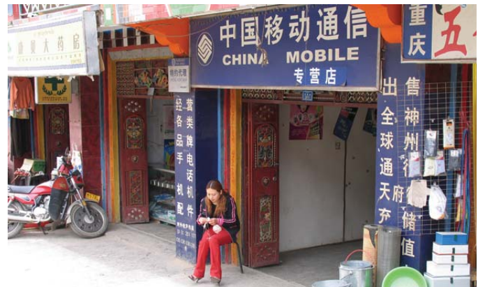
Chinese mobile phone store in Lhasa. Most new businesses are run by Chinese migrants looking for opportunities in Lhasa.

Before the Western Development Strategy was implemented, the TAR and other parts of Tibet had some of the lowest indicators in the entire PRC for health and education, and scored badly too in other areas such as average incomes and longevity. The railroad has already been the harbinger of what the regional government calls "leap-over style" economic development in the TAR and in Lhasa in particular, where modern supermarkets and five-star hotels are already appearing. But beneath that façade, the same levels of poverty among Tibetan people are set to remain.