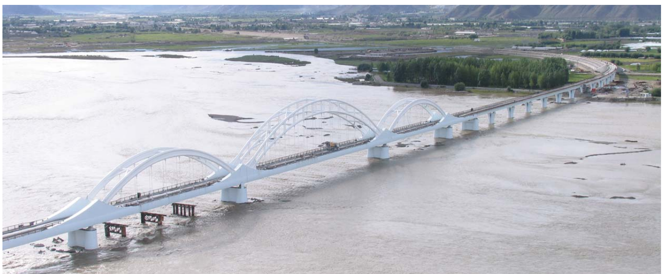
Bridge along the Qinghai-Tibet Railway, which transformed tourism in Tibet. The white arches were designed to symbolize Khatas [Tibetan ceremonial scarves].