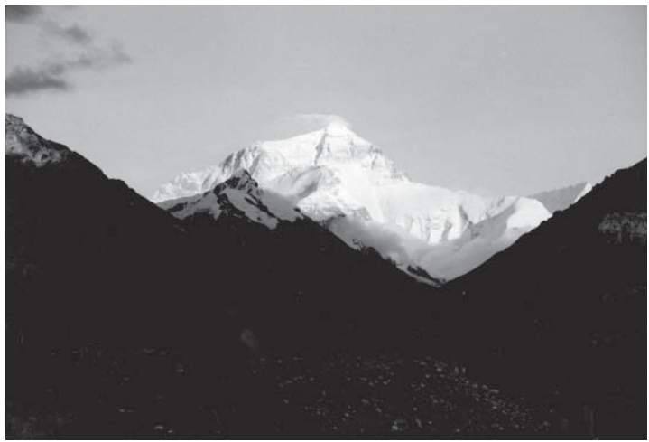
Mt. Chomolungma (Everest)

Zhang Qingli, the most senior Chinese politician in the TAR, has referred to a “life or death” struggle against the “Dalai clique”, and has described the Dalai Lama as “the biggest obstacle hindering Tibetan Buddhism from establishing normal order.” This intense political suspicion of religion in Tibet and the hostility towards the Dalai Lama shown by the Chinese authorities permeates almost all aspects of institutionalized Buddhism in Tibet. If indeed the Chinese authorities are involved in a “life or death” struggle for the loyalties of the Tibetan people, then the front line is in the monasteries, nunneries and temples of Tibet.