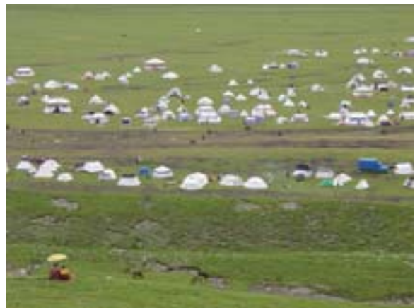
A religious encampment in the eastern Tibetan area of Kham, now incorporated into China's Sichuan province. Given the increased restrictions and control of religious practice in monasteries and nunneries, more Tibetans are attempting to connect directly with religious teachers and their practice in encampments outside more established monastic institutions.