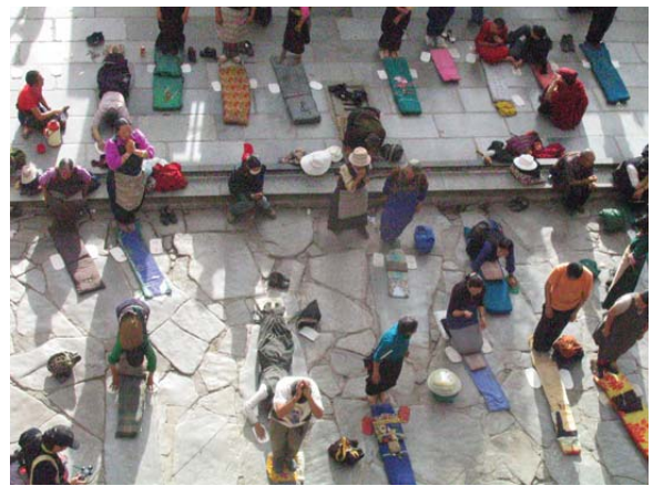
Tibetan pilgrims at the Jokhang Temple in Lhasa.

If you go to Sera Monastery in Lhasa, you might be invited to attend (upon paying an entrance fee) a religious debate among a group of monks. Debating philosophies expounded in Tibetan religious texts has traditionally been a key element of scholarly Buddhist learning, and the dramatic claps to accentuate a point make the debates quite a spectacle.