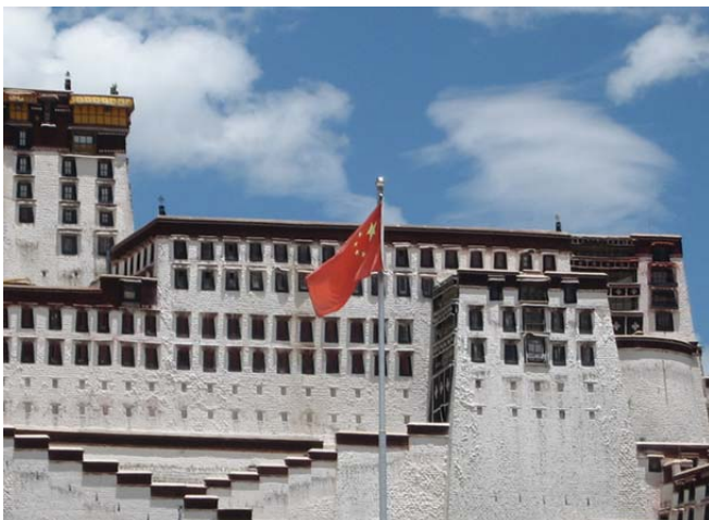
Chinese flag flying outside the Potala Palace; former home of the Dalai Lama in Lhasa.

But while foreign tourists may have more money – and the Chinese authorities may have the goods and services to reap that money – foreign tourists to Tibet have generally, although by no means universally, heard and sympathized with Tibetan nationalist versions of history which the Chinese government would dismiss as "reactionary".