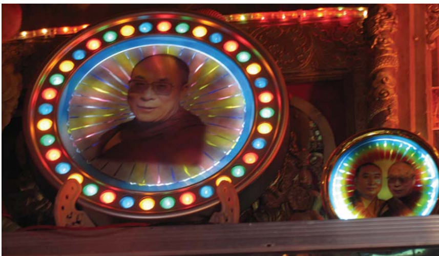
A secret image of the Dalai Lama on a shrine in eastern Tibet.

As a tourist, you should be aware of three things if you see a debate taking place at Sera Monastery or anywhere else: first, because the monks have had barely any formal religious education (through no fault of their own of course), the content of the debates is not as advanced as it should be in most cases – impressive though it may be to watch.